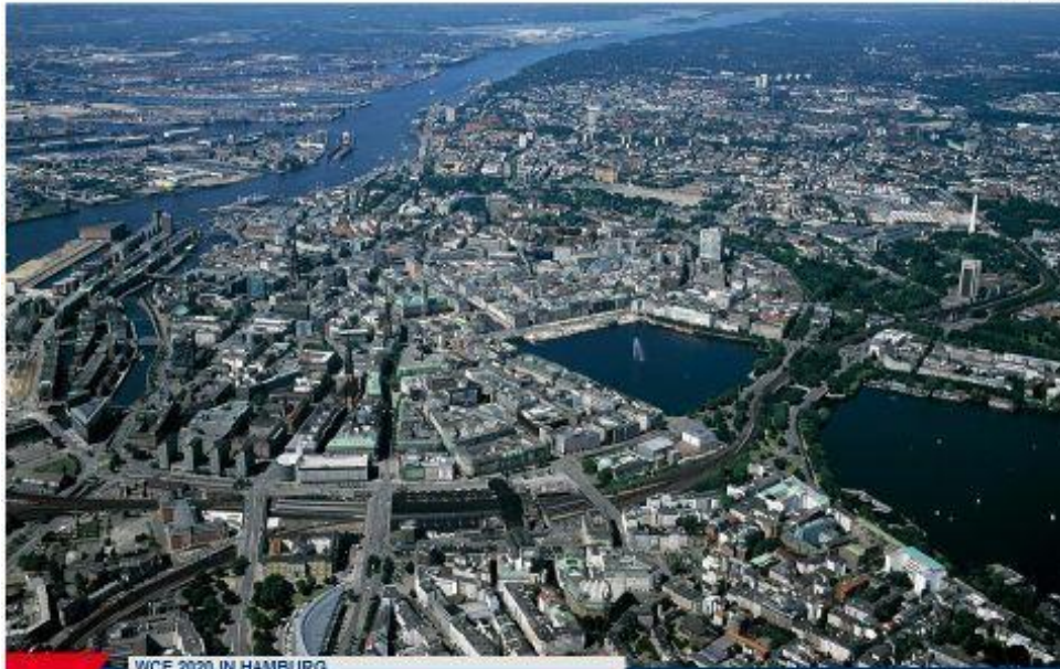
WCE 2020 IN HAMBURG